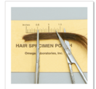
Cut the hair sample 1.5" from the end nearest the scalp.