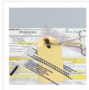
Send specimen to laboratory for analysis. Results are faxed to user within 48 hours.