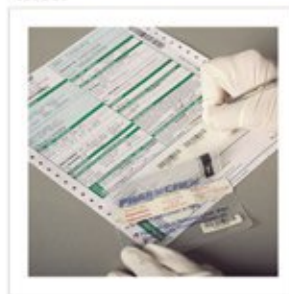
Send patch to laboratory for analysis. Lab transmits results within two days of receipt of patch.