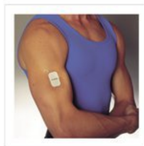
Apply patch to upper arm or torso.