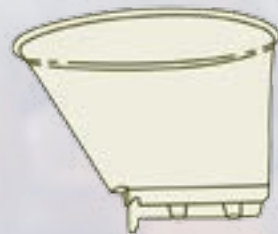
Alco-Sensor VXL Cup (#381)