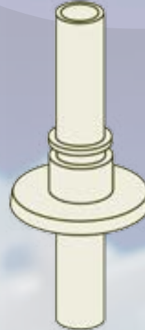
Alco-Sensor IV (#312)