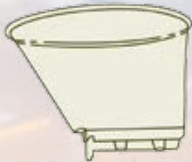
Alco-Sensor FST Cup (#353)