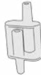
Square Saliva Trap (#333)