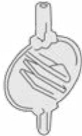
Guth Saliva Trap (#334)